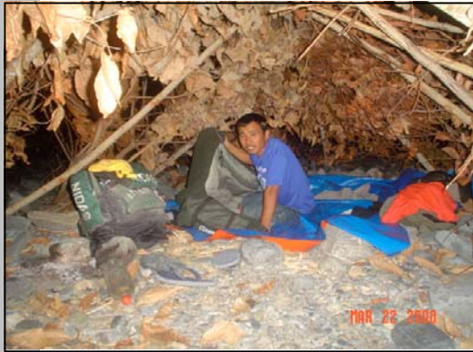
One picture shows the people in their thatch roofed "home" sitting on the tree branch floor

Notice in the pictures the primitive conditions. One picture shows the people in their thatch roofed "home" sitting on the tree branch floor WITH A FIRE burning in the middle of the floor. They are trying to keep warm! It appears they were safe in this picture.